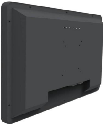
Back Side view