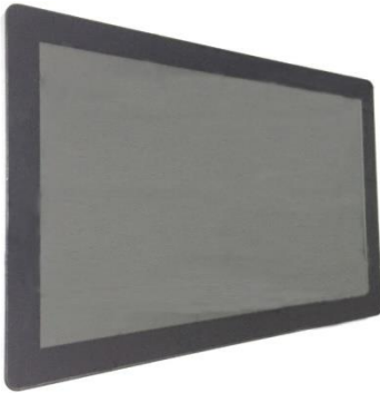
Front Side view